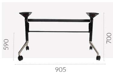
1200 Table Base